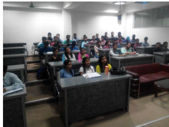
Participants during the Workshop